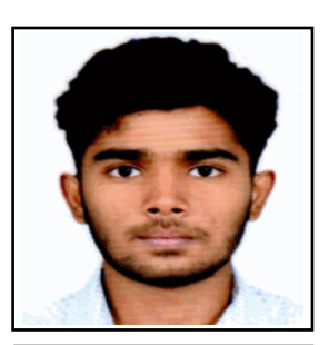
Shaibul · Seal