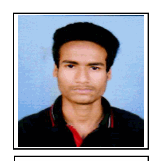
Sonnath Sar day

++ In no circumstances subject/s to be altered