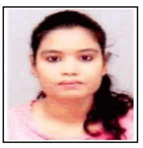
Deep! Ka Olaw